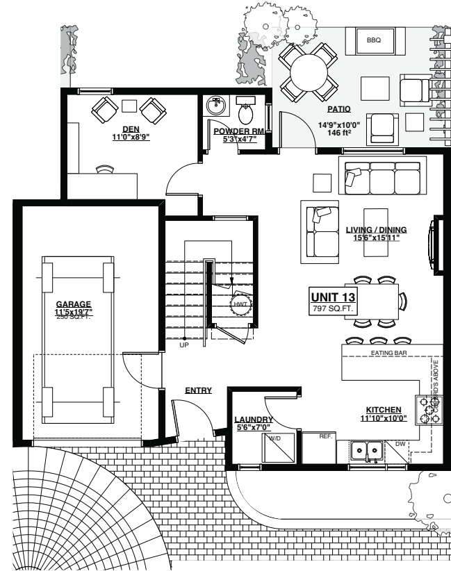
Main Floor 797 Sq Ft