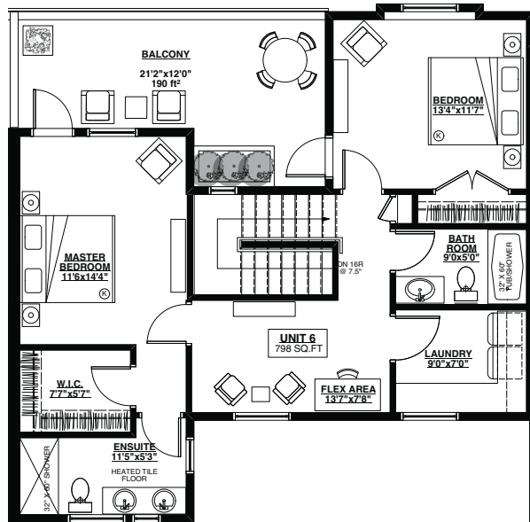
Upper Floor 798 Sq Ft